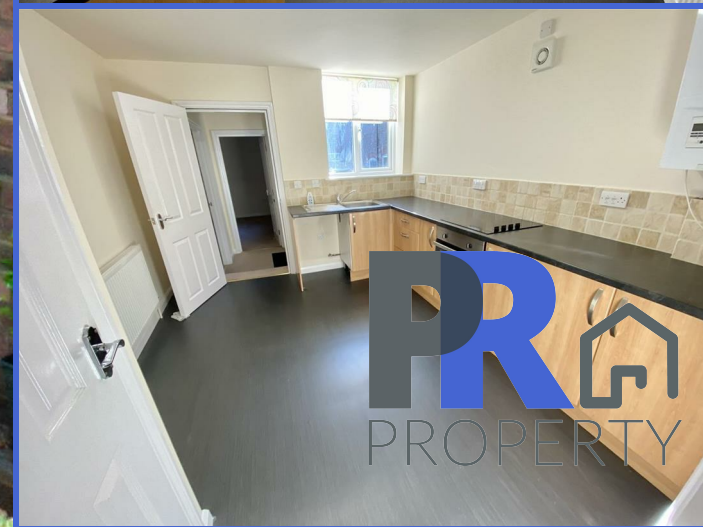
28a Reginald Street, Luton, LU2 7QZ £900 PCM